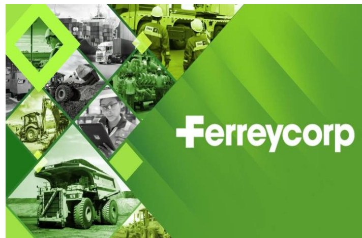
Video Ecodriving para proveedores de la corporación Ferreycorp

Animated video. Presentation of the strategy, standards, tools, and major projects related to supplier management. 60% participation of significant suppliers.